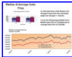
View Larger

The stories are plentiful: A California home listed at $7 million finally sells for $3.5. A Florida developer auctions off his completed but vacant condominiums at cost. Family homes sit on the market for months, bearing unrealistic bubble-era price tags.